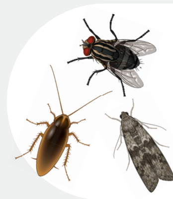
Water based Insecticide