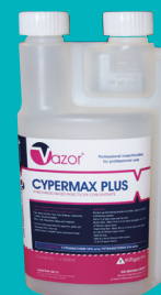
Vazor Cypermax Plus Contains: 10% w/w cypermethrin, 0.9% w/w tetramethrin