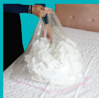
Water Soluble Laundry Bags