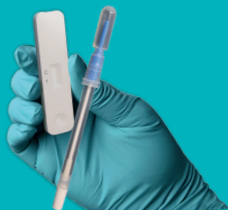
TruDetx Bed Bug Rapid Test