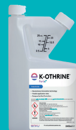
K-Othrine Partix Contains: 2.49% Deltamethrin