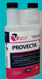
Vazor Provecta A 'molecular-mesh' non-residual product to spray directly at bedbugs, resulting in physical control by immobilisation, as an important resistance management tool.