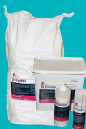
Vazor DE Powder Contains: Silicon Dioxide