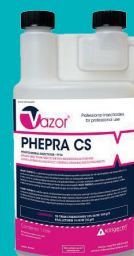
Vazor Phepra CS Contains: 10% w/w 1R Trans Phenothrin & 1% w/w PrallethrinBO