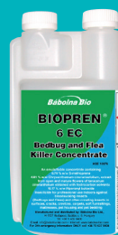
Biopren 6EC Contains: 6.74% w/w S-methoprene, 4.81% w/w Chrysanthemum cinerariaefolium & 10.17% w/w PBO